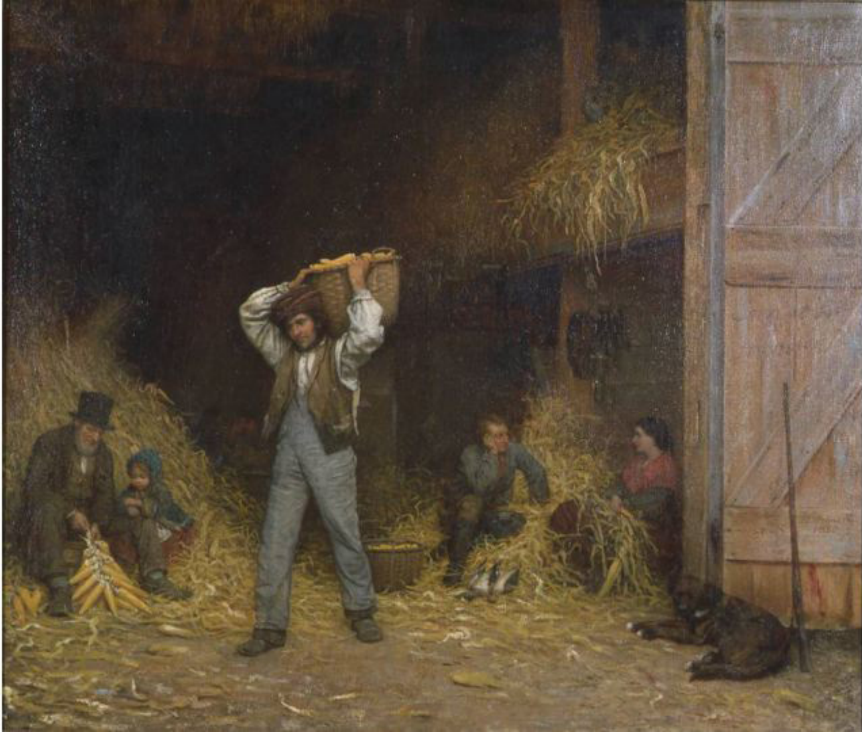
Eastman Johnson Corn Husking , 1860 Oil on canvas, 33½ x 38 inches Everson Museum of Art; Gift of Hon. Andrew D. White, 19.116