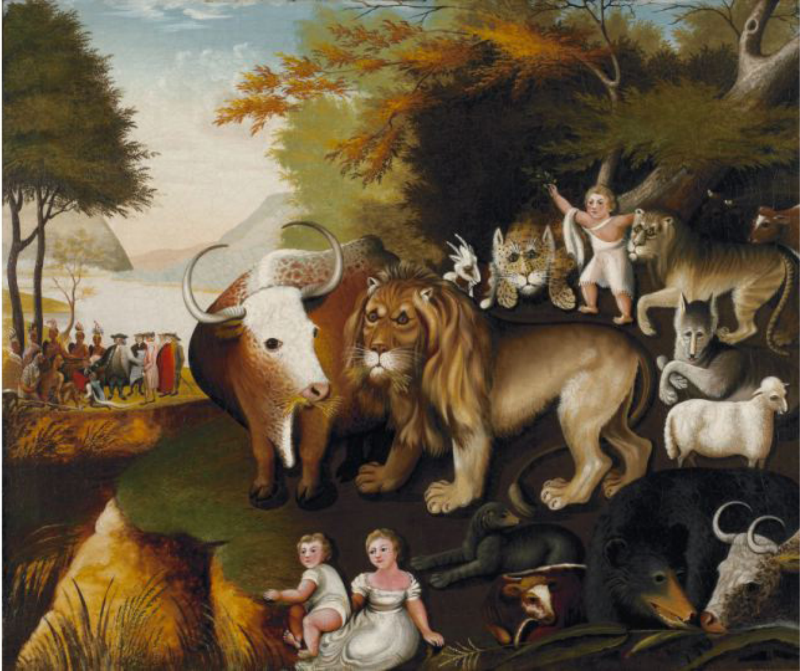
Edward Hicks American (1780-1849) The Peaceable Kingdom , ca. 1840-1844 Oil on wood panel, 35 x 41 inches Everson Museum of Art; Museum purchase with contributions from the community and friends of Syracuse and Onondaga County, 78.19