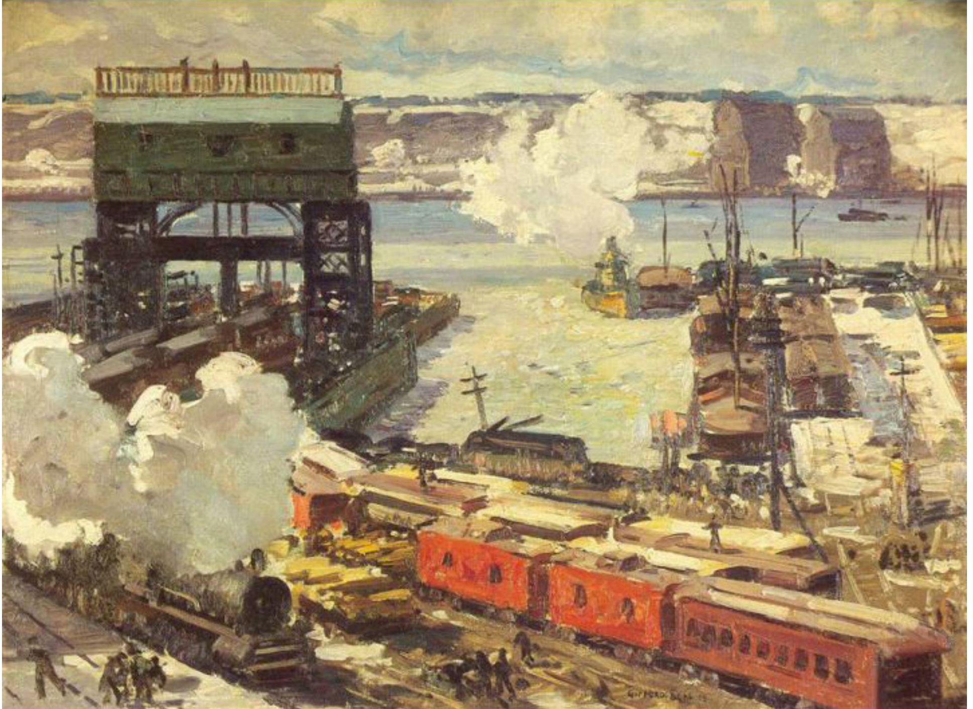
Gifford Beal Freight Yards , 1915 Oil on canvas, 45 x 57 inches Everson Museum of Art; Museum purchase with the Friends of American Art Fund, 15.80